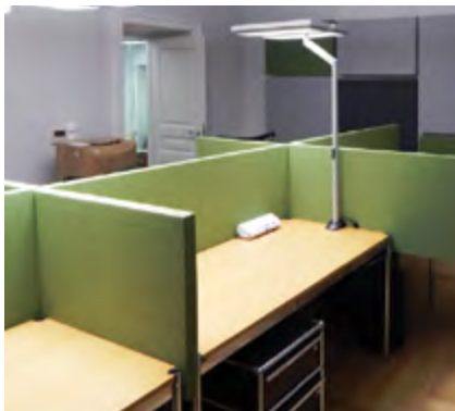
Office Acoustic Partitions

They are available in various colours and can be self extinguished (Flamability test EN13501-1 Class B, s2, d0).