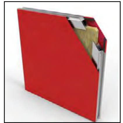
Section Detail of corner conjunction with acoustic fibrous infill

ALPHAcoustic Desk can be constructed in any shape and size , so as to satisfy the specific ergonomic and aesthetic needs of the office.